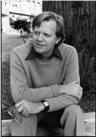
Hayden White during his first year at UC Santa Cruz, 1979

port and channel them. The range of dissertations that emerged was extraordinary. Within five years, Histcon's job placement statistics were among the strongest at UCSC. It would become a university-wide leader in diversity. And its faculty would grow to nine full-time FTEs.